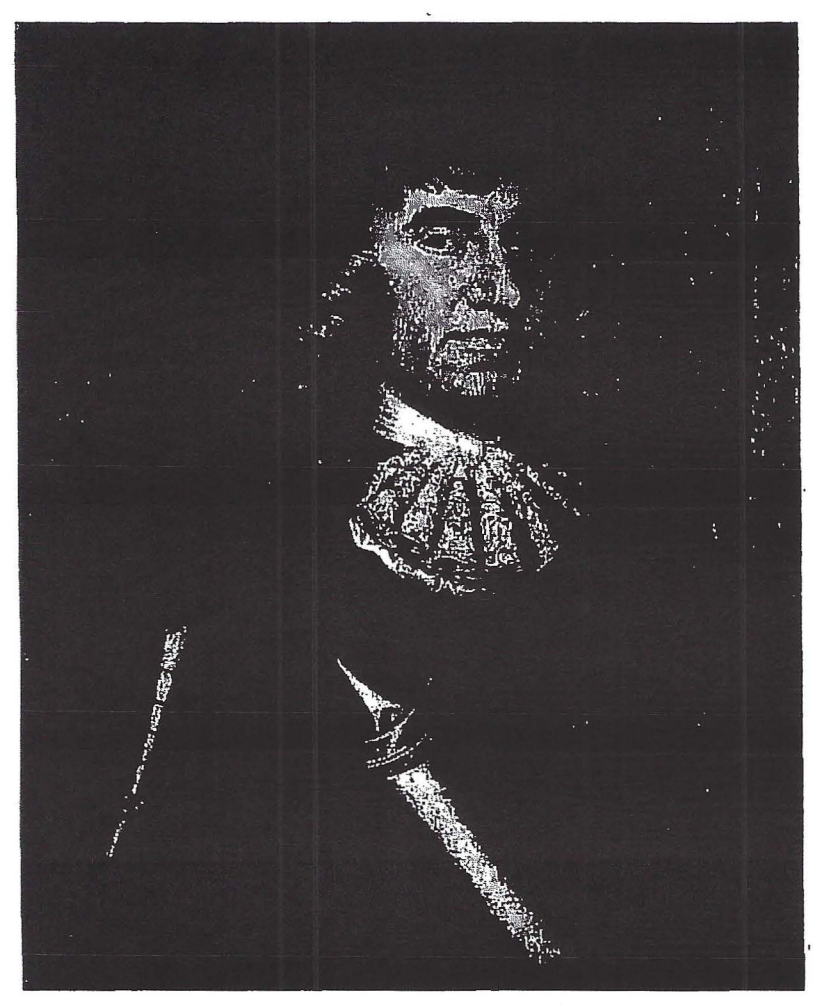
SIR ALEXANDER FORBES OF TOLQUHON.